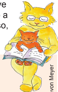
Illustration by Devon Meyer

Executive Function skills are skills you use to manage your attention, your emotions, your intellect and your behavior to reach your goals. They are at the core of the Seven Essential Life Skills. They include focus, working memory, cognitive flexibility and self control. When children are older, these skills include reflecting, analyzing, reasoning, planning, problem solving and evaluating.